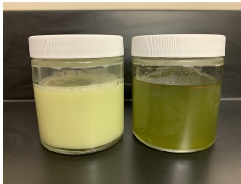
This comparison shows Xyler FC vs Ultra Flourish (both mixed with 10-34-0 for demonstration). Xyler FC mixes easily and stays in suspension. Ultra Flourish separates immediately.

Ensuring excellent mixing and even application is critical to consistent disease control across the whole field. Xyler FC is a new metalaxyl product from Vive Crop Protection that uses nanotechnology to ensure worry-free mixing with water, liquid fertilizers, micronutrients and other chemistry.