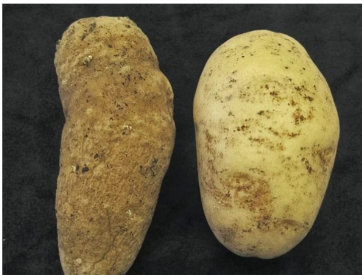
Nematode damage in potatoes.

Both products are based on the Allosperse® Delivery System, which allows products to be mixed and applied with foliar fertilizer, other chemicals and micronutrients.